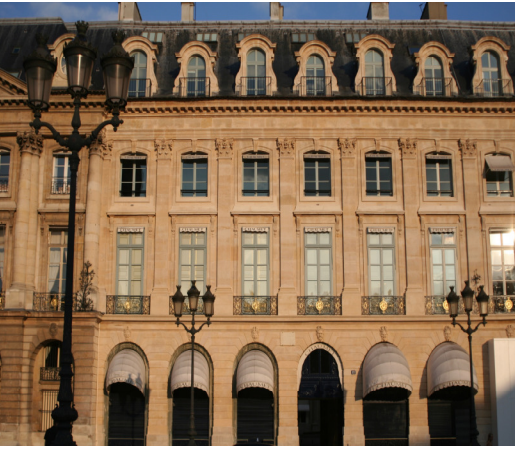
Place Vendôme, Apartment on second floor belonged to Chopin.

Crus Musicaux, a music festival that takes place every July in prestigious